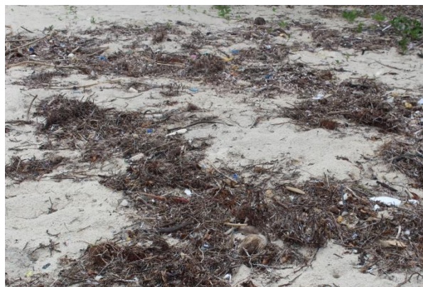
Figure 3 plastic waste littered all over the beach surface.