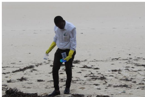
Figure 4 Showing a field personnel from CJGEA collecting the samples from dirt spread along the beach

The sampling exercise was conducted by a team of three staff members from CJGEA and they managed to collect all the required amount of the samples. The exercise lasted for close to three hours. The collection of the plastic scrap samples was stress-free as they were easily visible on the beach while the polythene pellets took us quite some time to locate and collect. All in all the exercise was a success and the samples were taken back to the office awaiting shipment to Czech Republic for lab analysis.