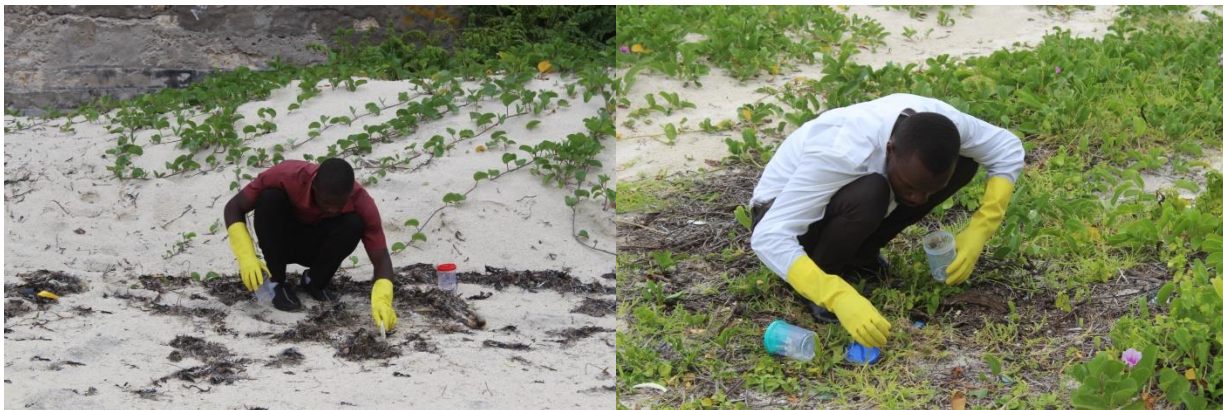
Figure 7 showing field personnel from CJGEA collecting the samples at Baobab beach