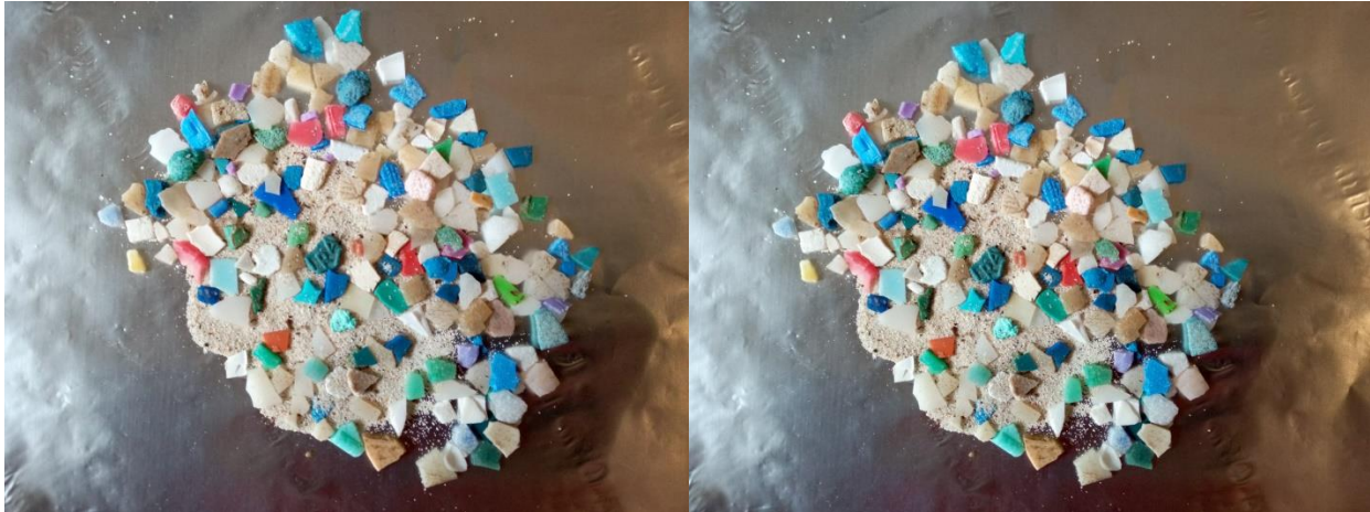
Figure 5 showing samples of plastic scraps collected from the beach.