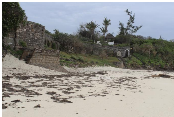
Figure 2 showing a hotel built next to the beach.

The beach is located next to Mada Hotels and some other hotels within the surrounding. The hotels are adjacent and in close proximity to the beach. Several domestic and international tourists frequent this beach hotel just to enjoy the sandy beaches. There are no industries next to this beach except that there is a highway, The Bofa road that is around 70meters from the beach and a couple of beach houses along the beach strip. The beach is littered by plastic and polythene wastes and this shows the level of pollution the wastes have caused in this area.