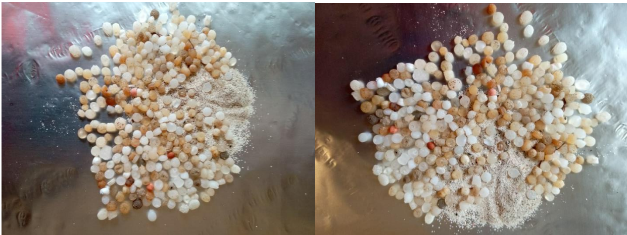
Figure 6 showing samples of polythene pellet samples collected during the exercise.